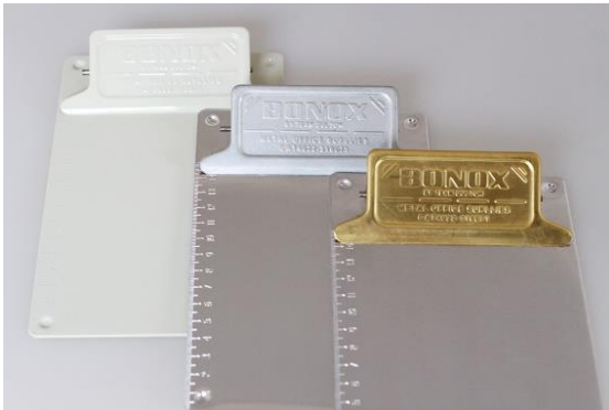
ITEM No. 117-300 A6 Metal Clip Broad "VOUCHER" 19*12*3.3cm