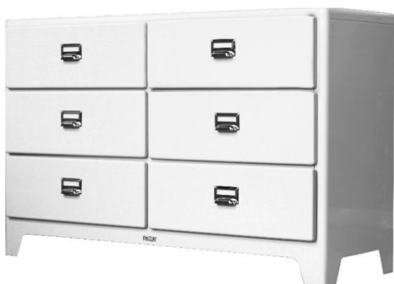
ITEM NO. 119-348 2 BY 3 METAL DRAWERS W.1200 D.430 H.760mm