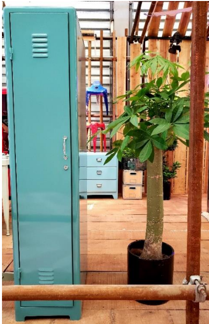
ITEM NO. 119-346-46 Locker 46 W.1875 D.430 H.955mm