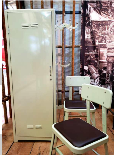
ITEM NO. 119-346-65 Locker 65 W.1600 D.560 H.545mm