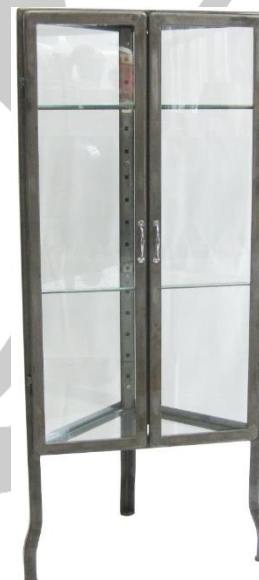
ITEM No.: BR-032 DOCTOR CABINET (TRIANGLE) L.700 H.1650 D.520 mm