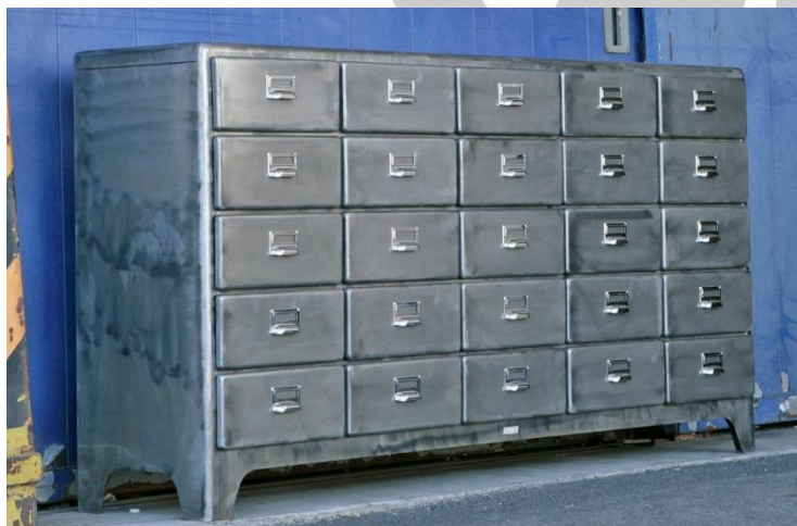
ITEM NO. 100-279 5 Columns By 5 Drawers W.1875 D.430 H.955mm