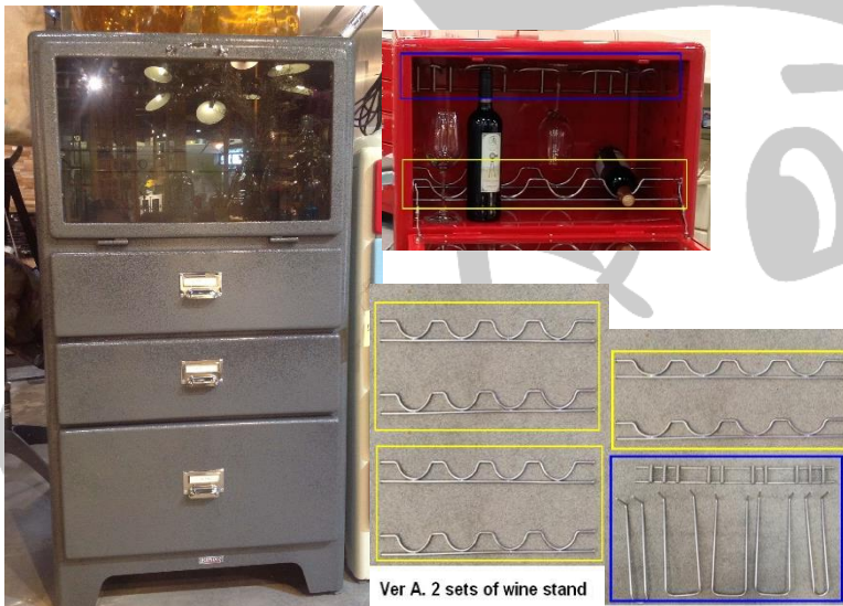
ITEM No: BR-027 Vertical Cabinet With 3 Drawers W.620 D.450 H.115mm