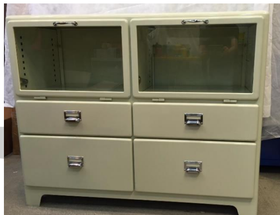
ITEM NO. BR-025 VERTICAL CABINET WITH FOUR DRAWERS W1200 D450 H970 mm