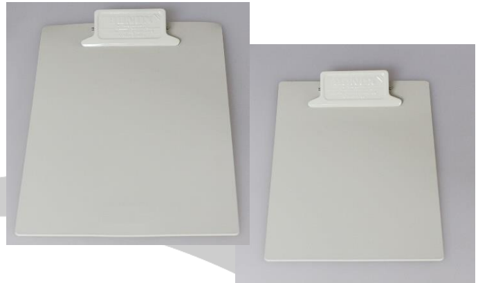
ITEM No. 117-300 A4 (L) Metal Clip Broad "VOUCHER" 34*21.5*3.3CM