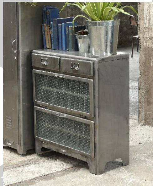
ITEM NO. 119-349 2 LAYER CABINET W.300 D.305 H.895mm