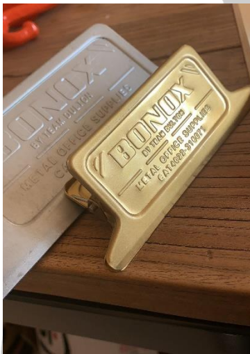
ITEM No: 117-329(R) Metal Clip 46*177*33mm 118-344(L) Metal Big Clip 65*165*45mm